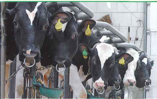
Genomics, a new era