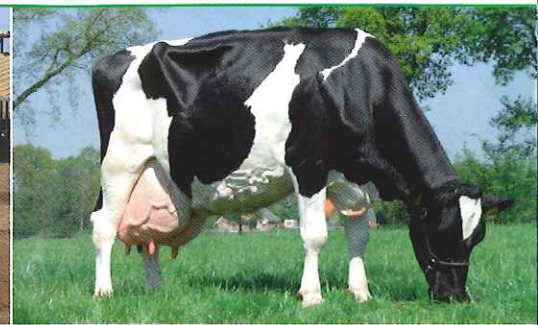
Breeding for kg fat and protein