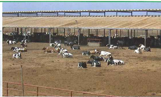
From 20 to 2,000 cows in Maroc Vert